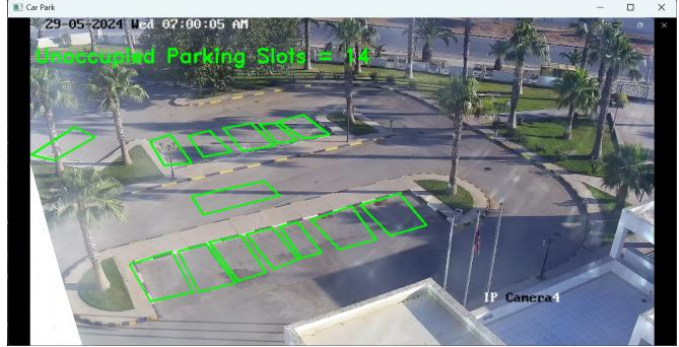
Figure 4 Parking slot selection

After defining the parking slot coordinates, OpenCV was utilized to load the video frames captured from the parking area. For each frame, polygons representing individual parking slots were drawn using the predefined coordinates. Specifically, OpenCV's cv2.polylines() function was employed to overlay the boundaries of each parking slot on the frames, providing a clear visual segmentation of the parking areas. The annotated frames were displayed in real-time using cv2.imshow().