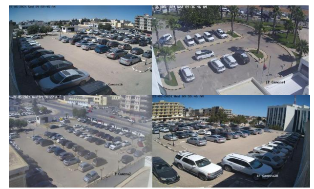
Figure1 Photos of the obtained surveillance footage

After preprocessing, the system employs a YOLO to detect and locate vehicles within each video frame. The model analyzes each frame to identify vehicle positions and labels them accordingly.