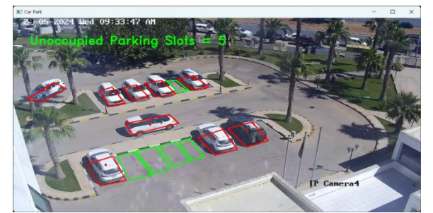
Figure 6 Detection Results in a 14-space parking

These findings confirm the robustness and effectiveness of using a pre-trained YOLO model combined with OpenCV-based image processing for parking occupancy detection, outperforming traditional manual and sensor-based methods in both efficiency and accuracy.