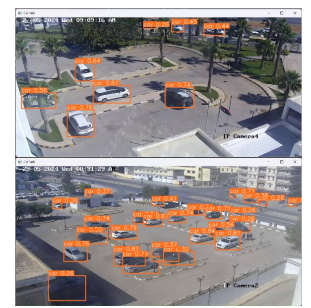
Figure 5 model inference result on custom data

YOLO Model Training: We are using the pre-trained YOLOv8 , a state-of-the-art deep learning model for car detection without additional training for real-time car parking detection systems.