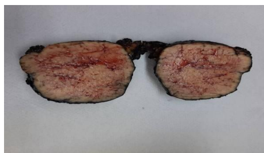
Figure 1. Macroscopic picture for an adrenal tumor in 4 4-year-old boy consists of an oval, yellowish brown, firm tissue solid mass encapsulated, measuring 9x7.4x4.5cm, weighing 20 grams

Male patients had a higher age at presentation (ranging from 4 years to 17 years) with a mean of 12 years in comparison to female patients who presented with an average of 3.5 years (ranging from 1 year to 8 years). In addition, one patient (10%) had a significant family history of malignancy and an underlying genetic predisposition. Radiological investigation demonstrated that the adrenal lesions were present on the right side in 8 (80%) patients and on the left side in 2 patients. All patients underwent primary surgical excision. The tumor size had a median of 4 cm (ranging between 2 and 5 cm), and tumor weight was between 10 and 200 g. Macroscopically, the tumors were circumscribed or encapsulated and occasionally showed areas of hemorrhage without indication of tumor spread to nearby soft tissues or organs in these patients, except presence of a nodular lymph node in one patient who had hemihypertrophy. Furthermore, no evidence of basement vein invasion (Figure 1).