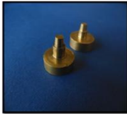
Figure 1. Metal master die

making standardization. A perforated custom-made tray was fabricated that could be placed in the same position on the master die for each impression. The metal master die was prepared by a milling machine to resemble a prepared tooth with 5mm height and 5mm width at the base, the occlusal taper was 6° and 1mm shoulder finish line (Figure 1).