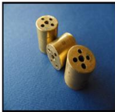
Figure 2. Custom made perforated metal tray

The die has a 24mm diameter base to ensure proper handling. Each custom-made perforated tray was cylindrical with an inner diameter 7mm (to accommodate the base of the mater die) and an inner height of 9mm was made to act as a tray for accommodating the impression materials [39] (Figure 2).