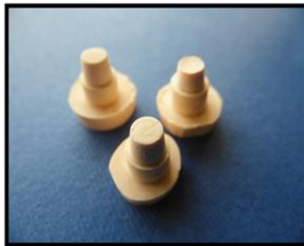
Figure 3. Stone dies

Measurements of the dimensional accuracy (radiographic analysis), all samples submitted for CBCT for evaluation of their dimensions, and CBCT images were acquired using a Next Generation I-CAT scanner (Imaging Sciences International, Inc., Hatfield, USA). A scout view was obtained and adjustments were made to ensure that all samples were correctly aligned in the scanner according to the adjustment light beam before acquisition. Measurement of height, At the section module, sagittal and coronal reference lines were brought to intersect at the center of the die to be evaluated (Figure 4). Then, using the reorientation tool, the volume was readjusted to oblige the coronal and sagittal lines to be parallel to the long axis of the die. The two reference lines were finally ensured to intersect at the center of the die at the axial view. The height of the die was measured at the produced sagittal and coronal views, where measurement was made by drawing a line from the highest point of the die to a line previously drawn tangential to the base of the finish line. Measurement was taken at coronal and sagittal views in five different levels.