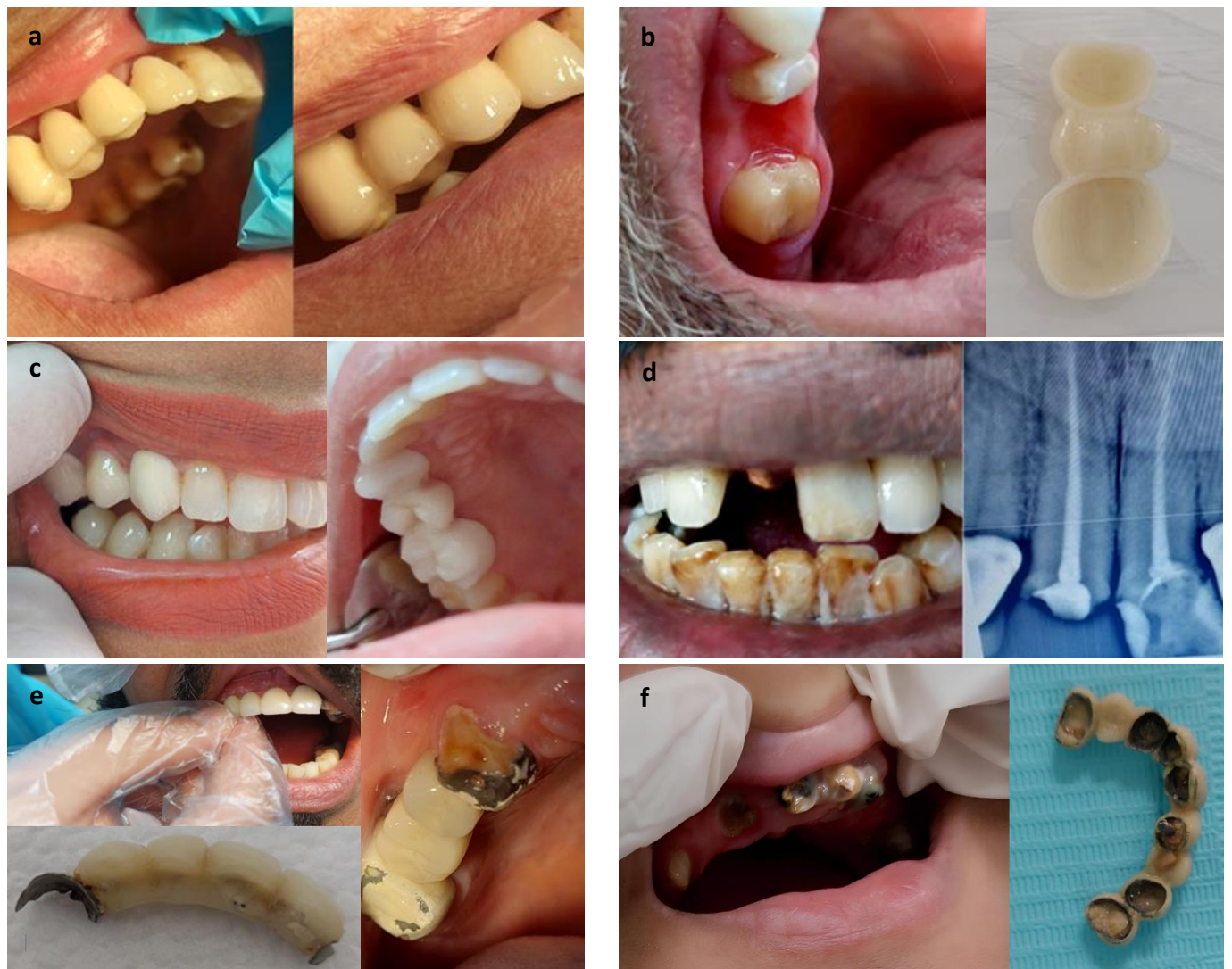
Figure 2. Demonstrate visual examples for each category of Manappallil's classification.

Figure 2 from (a) to (f) illustrate examples of images for each category of Manappallil's classification system, which address common dental bridge failures seen in clinics. These figures help to better understand and use the classification system, and they provide an approach to evaluating the severity of fixed partial denture failures and planning treatment.